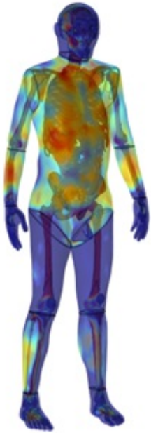
Figure 3 : Male model at moderate exercise (+400W) in temperature 35°F (1.7°C) and 25 mph (11.17 ms -1 ) wind after 180-minute exposure.