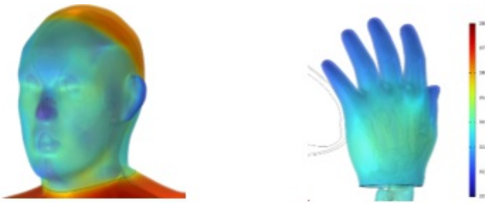
Figure 2 : Female model temperature distribution in the head and hand at 35°F (1.7°C) and 5 mph (2.23 ms -1 ) wind after 180-minute exposure.